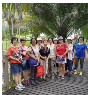
Ramble in Bishan-Ang Mo Kio Park on 17 June 2018.