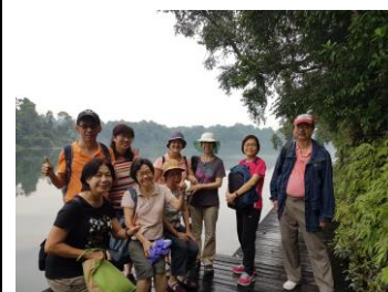
Boardwalk @ MacRitchie Reservoir 20 May 2018

Please refer to our weekly notification for updated information