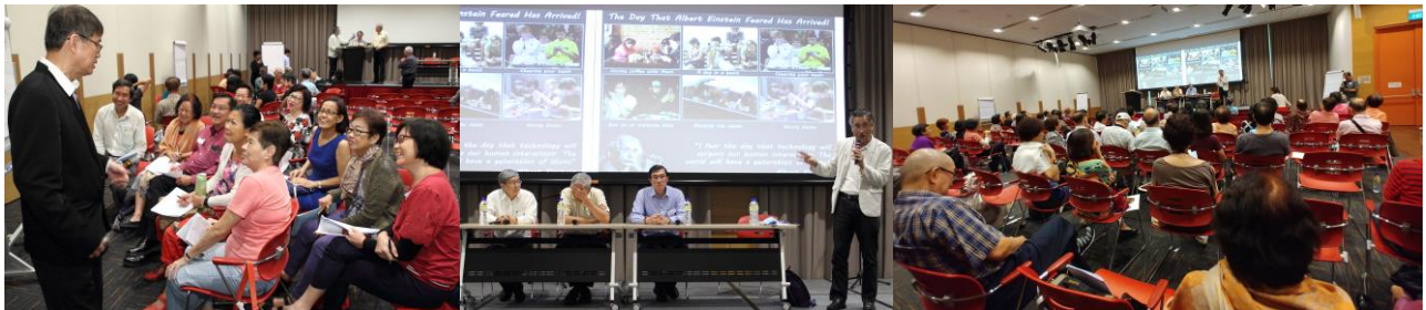
Facilitated Group Discussion