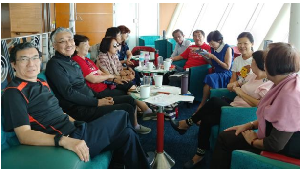
Meeting at a lounge to discuss strategic plan.

Annual retreat for this year was a 5D4N trip, from 21 January to 25 January, in Royal Caribbean cruise with stop-overs at Port Klang and Phuket. This trip was organized for our core volunteers, and SACE Board members and Secretariat Administrators. This retreat offers us a chance to unwind, relax and enjoy the sea breeze, apart from great food and entertainment programs. This sets the mood for bonding, team building as we discussed strategic plans for the years ahead as well as looking at ways to improve our work system o – from a bottom up feedback.