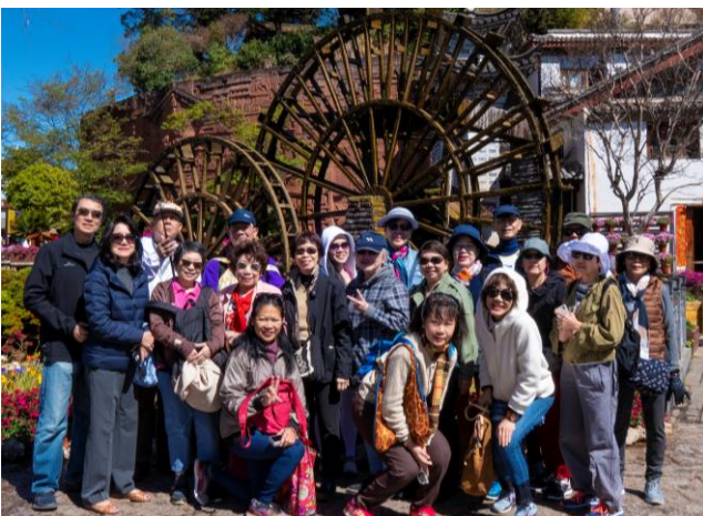
Dayan Ancient Town

Next Travel Community Meeting: 11 May 11.30am to 1pm @ Peninsula Plaza