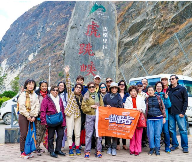
Tiger Leaping Gorge