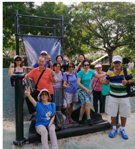
Ramble walk in Nov 2019