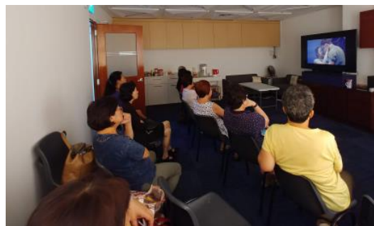
Film and Discussion - Miss Saigon