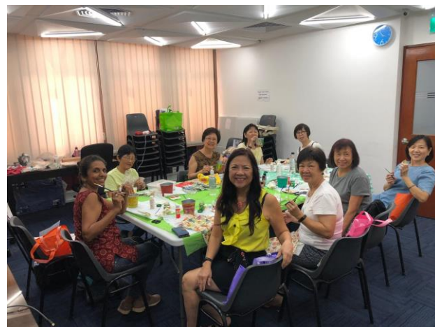
Decoupage workshop - January 2020

Our regular monthly activities have been going on for several years now and still going strong with new faces seen for each new session.