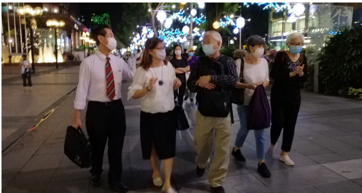
The glitters of Xmas light up in Orchard Road – 10 Dec Jalan Jalan