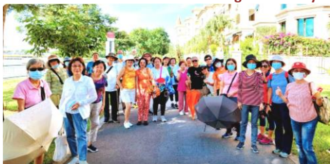
Started walking from National Stadium