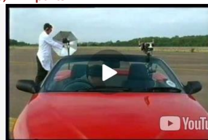
Six Experiments that Changed the World - Einstein and the Eclipse - Part 1 of 2