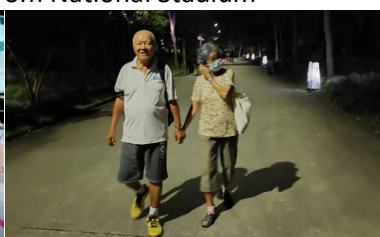
Walking hand in hand towards Bay Front MRT to end the journey