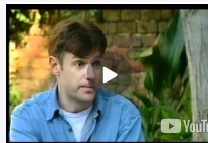
Six Experiments that Changed the World - Einstein and the Eclipse - Part 2 of 2

Watch these on YouTube (11:59 mins each part, total 23 mins) and discuss at Bucky Chat. YouTube link: https://youtu.be/QgNJ64CPKv0 for Part 1 https://youtu.be/y39-5swk5GM for Part 2