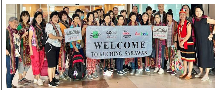
A warm welcome at Kuching airport