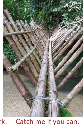
A walk at Bako National Park. Catch me if you can. Been there done that!