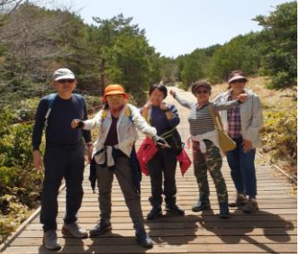
Mt Hallasan Eorimok trail