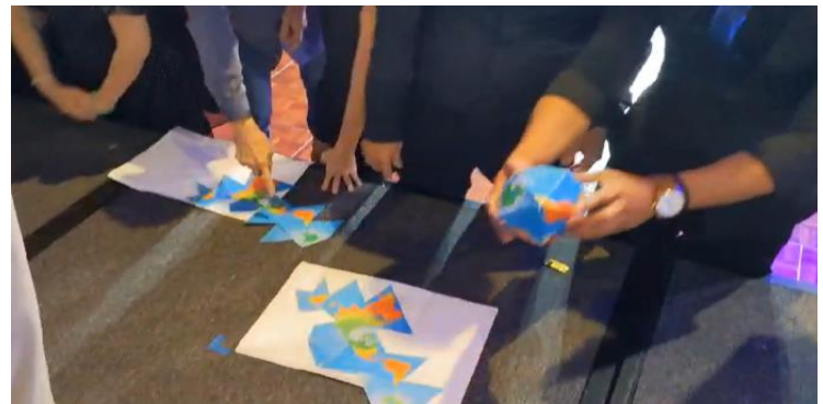
Table Game – fixing the Dymaxion Map