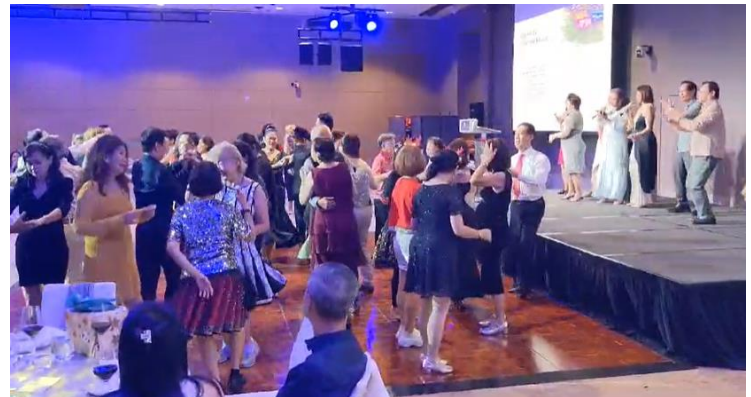
Danced to the tune sang and led by the contestants