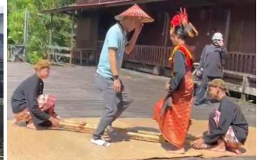
Learn to make Mee Sua and bamboo dance.