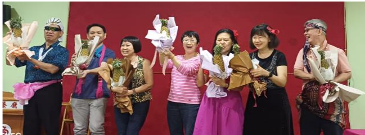
Entertainers on stage during the Getai Night in Mukah.