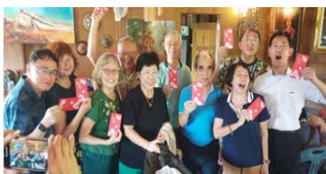
Rewards for overcoming the fear factor of eating sago worms, a protein-rich traditional local delicacy.