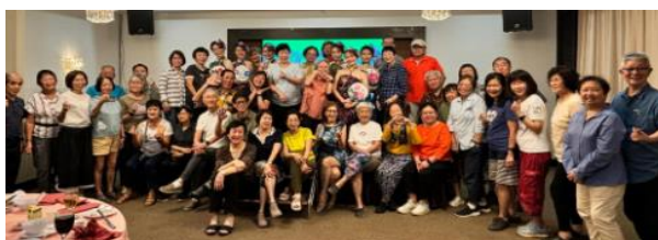
Welcome Night on first day of arrival.