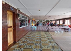
Visited TR Emmerly, the Longhouse near Mukah which houses 30 units, stretching 120 metres long.