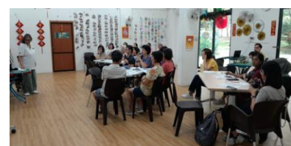
Left: Navigating Around Singapore conducted at CDAC Right: Brain Gym conducted at AAC Queenstown, our first partnership with AAC, Active Aging Centres.