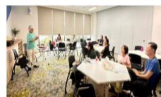
Left: Knitting class is one of the several courses conducted at HomeTeam at its spacious surroundings. It enables us to offer our courses to HomeTeam members.