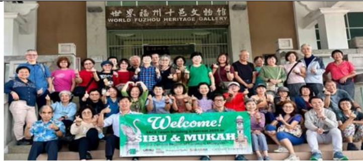
Visit to World Fuzhou Heritage Gallery