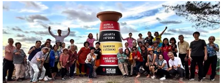
Stunning sunset veivs at Kaul Beach, Mukah