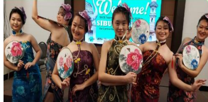
Cultural performances on Welcome Night.