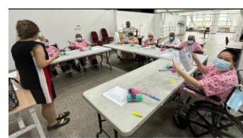
Left: Gardening 101 conducted at Gardens by the Bay. Right: Knit One Purl One conducted at Sree Narayana.