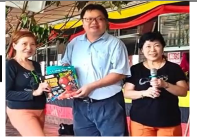
Donation of books and stationeries at the Longhouse for children from the neighbouring schools.