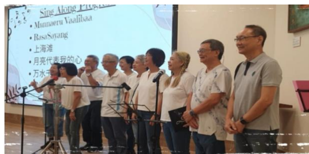
Harmonica performance at Kwong Wai Shiu Hospital @ Potong Pasir on 12 June.