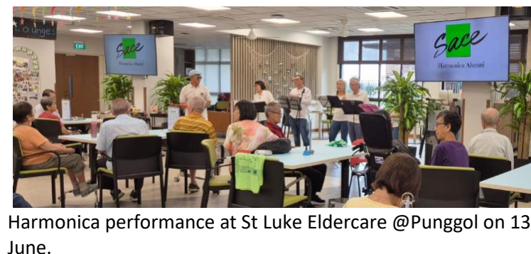
Harmonica performance at St Luke Eldercare @ Punggol on 13 June.